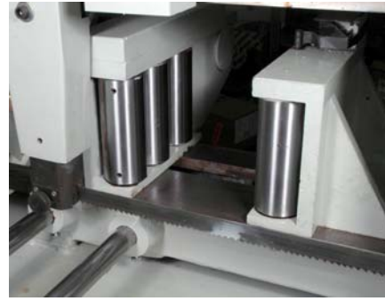
Motorized roller feeding system